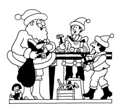
2014 RSCDS Workshop and Ball Committee

First, we would like to thank our members and friends from out of province for the fine response we had to our recent questionnaire about options for the 2014 Workshop and Ball. We received a total of 41 responses, 9 from out of town friends and 32 from our general membership!